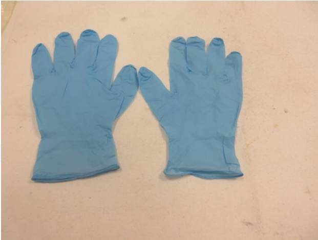
Sample described as Disposable Nitrile Glove NPF2001-2005